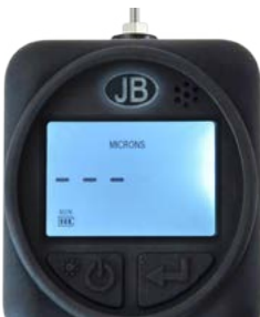
Loading Menu – Warm up mode

The unit will display “oooooo” when it is at atmospheric pressure, or at a pressure over 100,000 microns. This indicates an over range condition. When the pressure is at 100,000 microns or lower, the gauge will display the value.