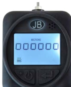
Atmospheric Pressure – Normal operation mode