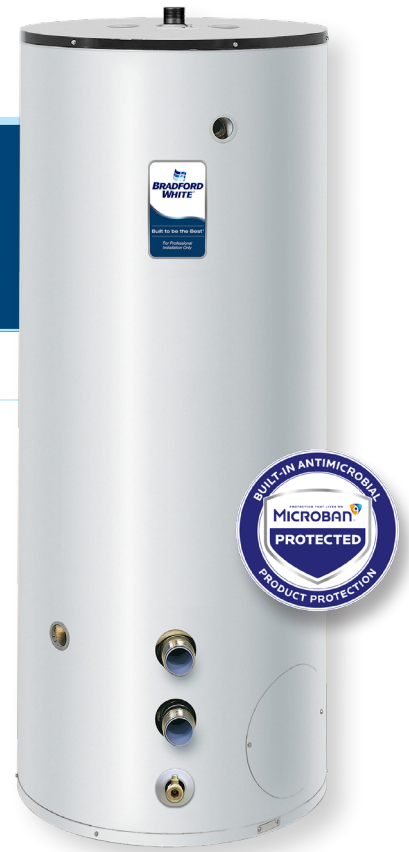
Photo is of M-3-ST80R5