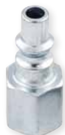
A TYPE PLUG - FEMALE