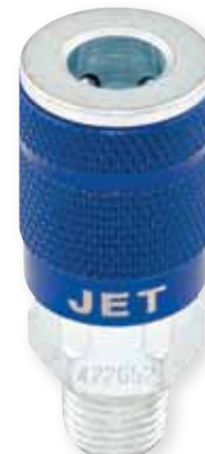
A TYPE COUPLER - MALE