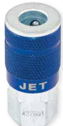
A TYPE COUPLER - FEMALE