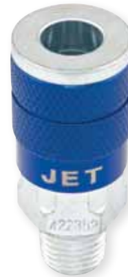
T TYPE COUPLER - MALE