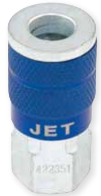
T TYPE COUPLER - FEMALE