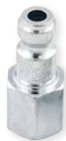
T TYPE PLUG - FEMALE