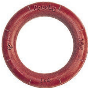
S-643 Weldless Rings

*Ultimate Load is 5 times the Working Load Limit. Based on single leg sling (in-line load), or resultant load on multiple legs with an included angle less than or equal to 120°.