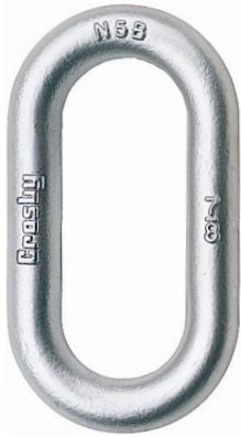
G-340 / S-340 Weldless End Link