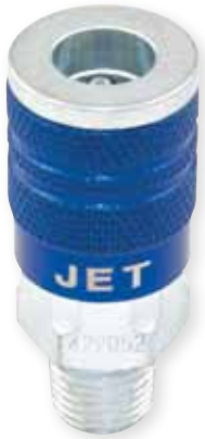
I/M TYPE COUPLER - MALE

Please note: Products supplied in blister packs are sold as a single unit. Products sold in bulk packs are sold by the each but must be ordered in bulk pack quantities (i.e. 10 or 20) or multiples thereof. Bulk packs will not be sold in less than package quantities.