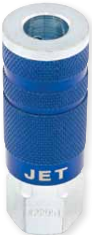
L TYPE COUPLER - FEMALE