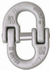
A-1337 10 Alloy Connecting Link