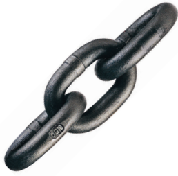
Spectrum® 10 Grade 100 Alloy Chain