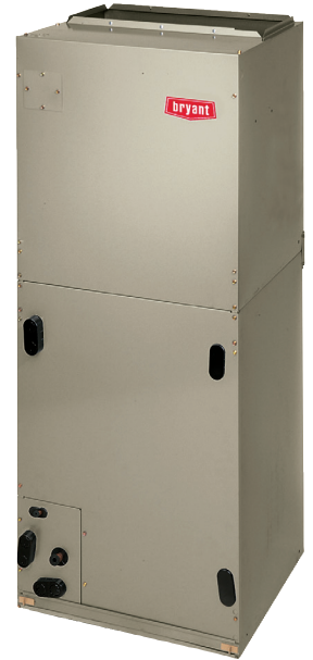
MODELS FZ4 & FV4