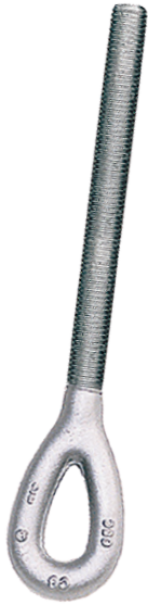
HG -4037 Eye End Fitting