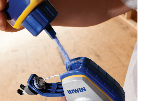
*as compared to traditional chalk reels