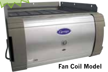
Fan Coil Model