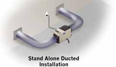
Stand Alone Ducted Installation