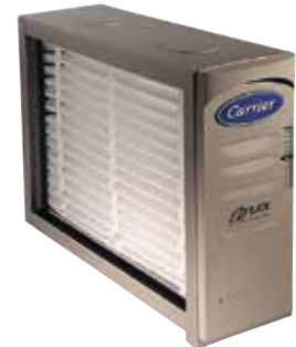
EZ Flex™ Cabinet