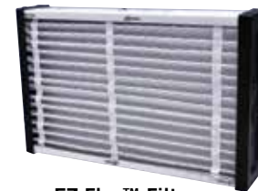
EZ Flex™ Filter