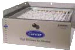
Filter Cabinet for Fan Coils