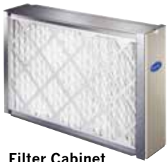
Filter Cabinet for Furnaces