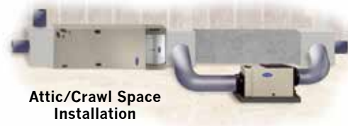
Attic/Crawl Space Installation