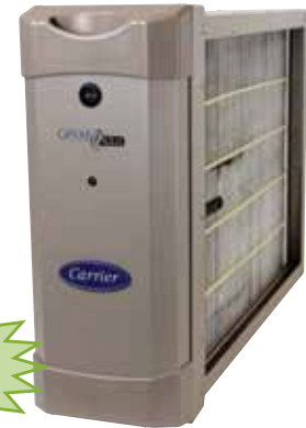
Use with either furnaces or fan coils