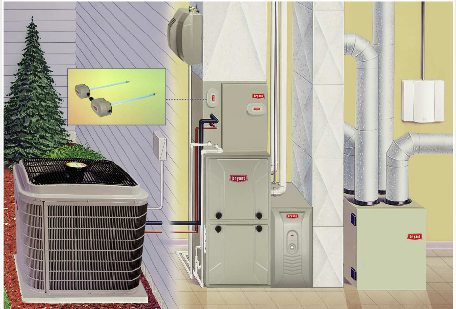
Air Conditioner and Gas Furnace System

Bryant UV Lights use about the same electricity as a 75-Watt light bulb. Just replace the lamp(s) once a year to maintain maximum effectiveness.