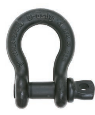
S-209T THEATRICAL SHACKLE