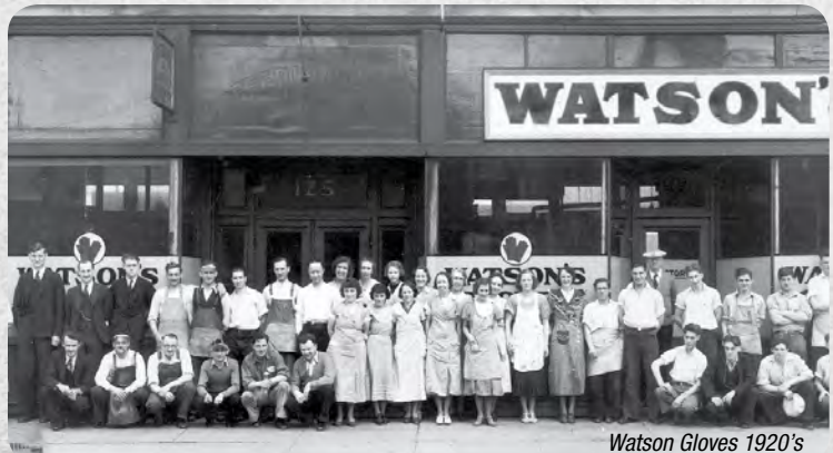
Watson Gloves 1920's